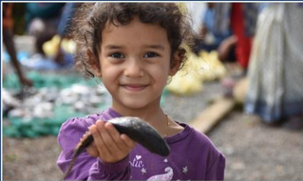
Our first fish harvest!