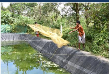
Neighbour boy helping us to catch fish