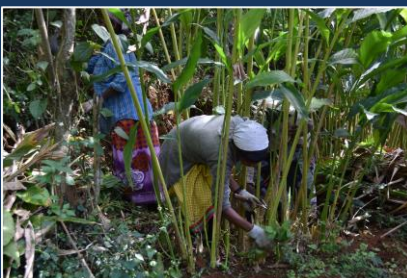
Our workers are cleaning the cardamom plants