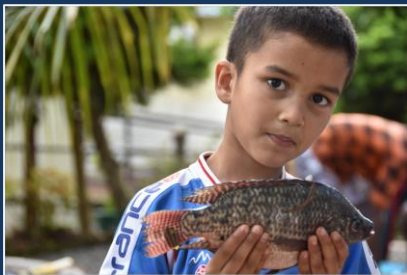
Children helped weighing the fish!